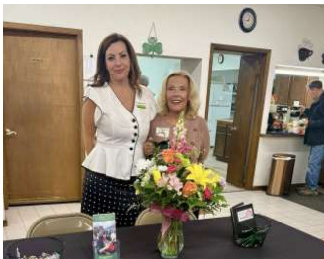
Thank you Raven with Edgewood for sponsoring caramel rolls on Thursday. What a treat to stop in and receive a free roll!