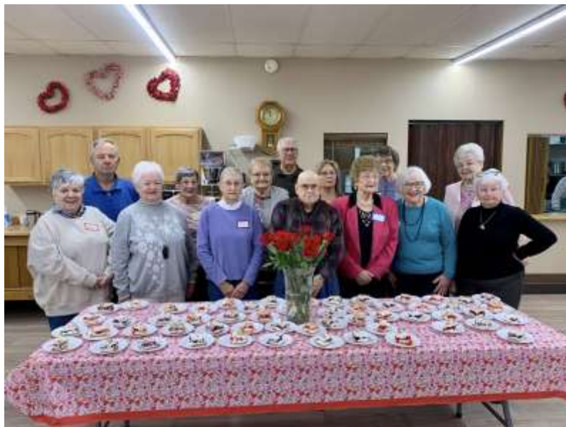
Happy Birthday to ALL our FEBRUARY members!

Our first walk will be in early to mid-April. It will be light and local - and have benches along the path!! Now that's a great idea.