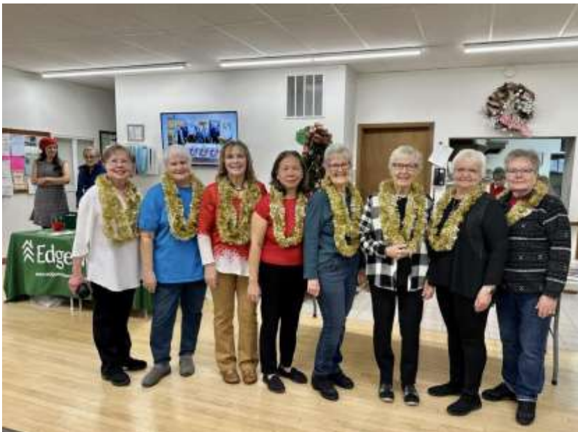
Our Senior Center Line Dancers spreading Christmas cheer by dancing on a caramel roll Thursday!