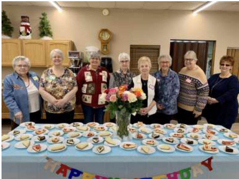
Happy Birthday to ALL our JANUARY members!