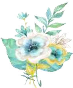
Beautiful Roses donated by ZONTA Club of Spearfish for all our December Birthday honorees.