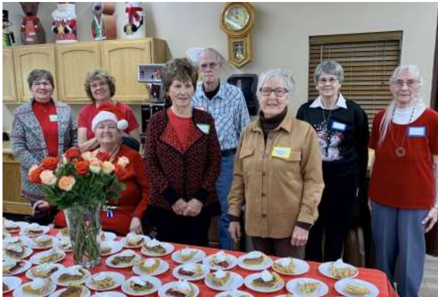
Happy Birthday to ALL our DECEMBER members!