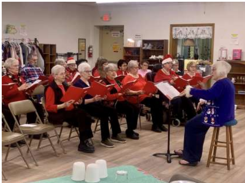
Our Senior Center Chorus performing at the December Birthday Luncheon.