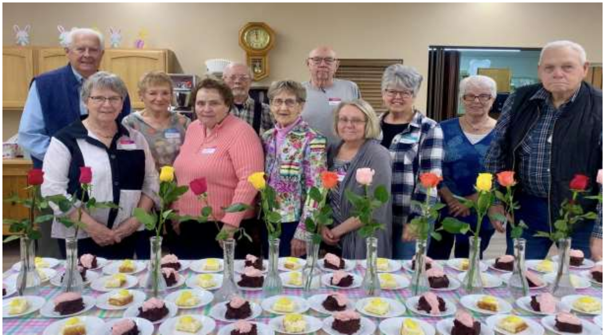
Happy Birthday to all our April Members!

If you are a current member of our Senior Center you get a free meal on your Birthday Month during our monthly luncheon. Our next luncheon is scheduled May 3 rd at 11:30AM.