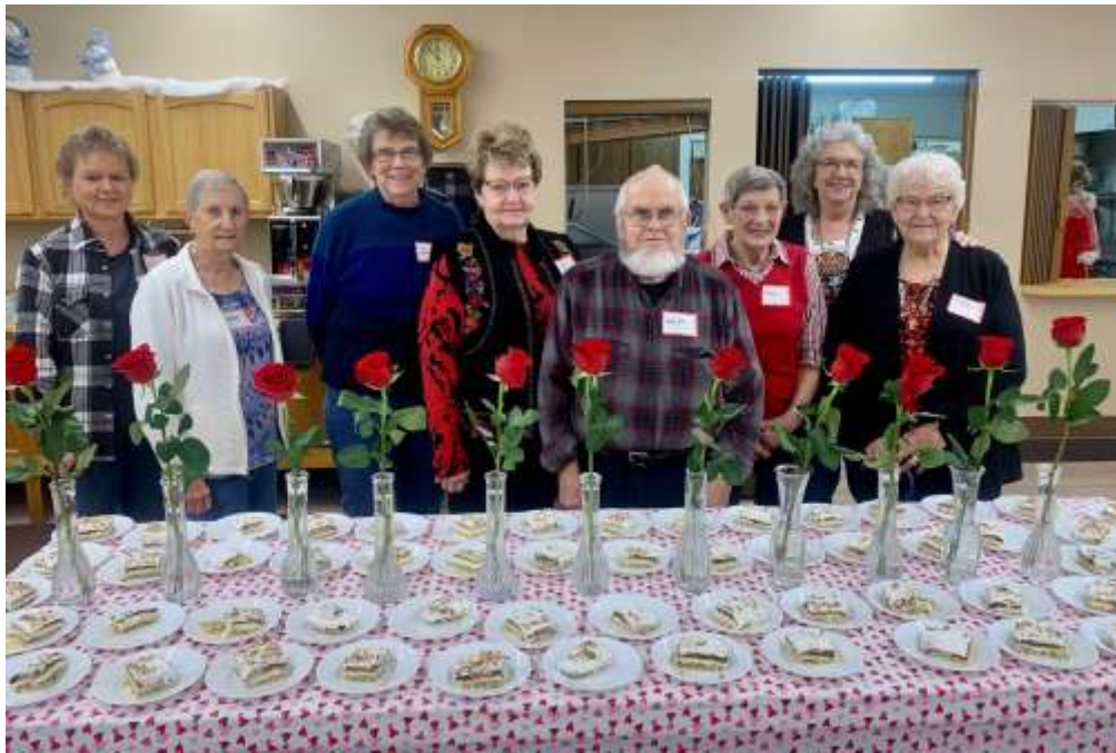
Happy Birthday to all our February friends! We enjoyed a fun luncheon filled with friends and great food. Our next Birthday Luncheon is March 1 st !