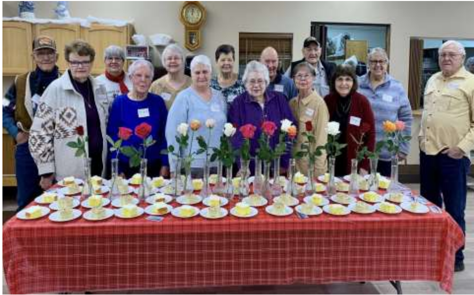
Happy Birthday to all our January friends! We enjoyed a fun luncheon filled with friends and great food. Our next Birthday Luncheon is Feb 2nd!