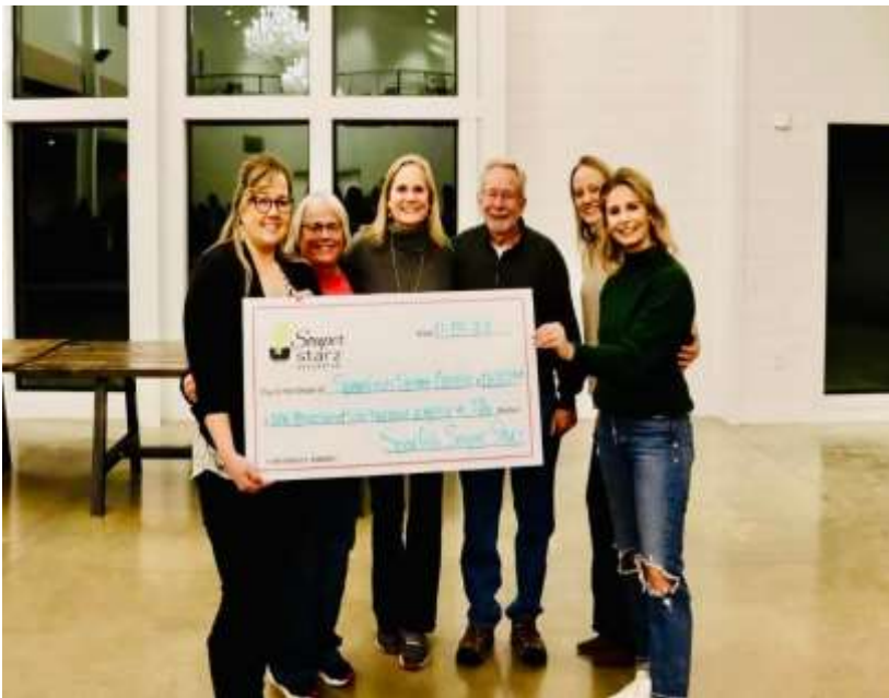
A picture from 2022 of The Spearfish Senior Center receiving the check from the Souper Starz Event that was held at The Barn at Aspen Acres.